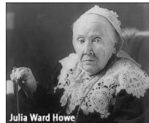
Julia Ward Howe

Influenced by Howe's efforts, Anna Reeves Jarvis began a crusade to start a women's memorial day. After Jarvis' death, her daughter, Anna M. Jarvis, sought to establish a "Mother's Day" in remembrance of her mother and in honor of peace. She petitioned the superintendent of the church where her mother had taught Sunday School for 20 years, and on May 10, 1908, Mother's Day was observed in West Virginia. The custom spread